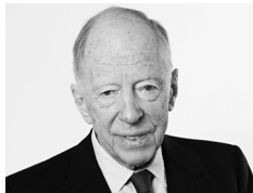
Lord Rothschild, OM GBE

Total returns for the six-month period under review amounted to 8.5%, with your Company's net asset value per share increasing to 1,958 pence. Net assets reached an all-time high of over £3 billion and your Company's share price increased by 10.1% on a total return basis.